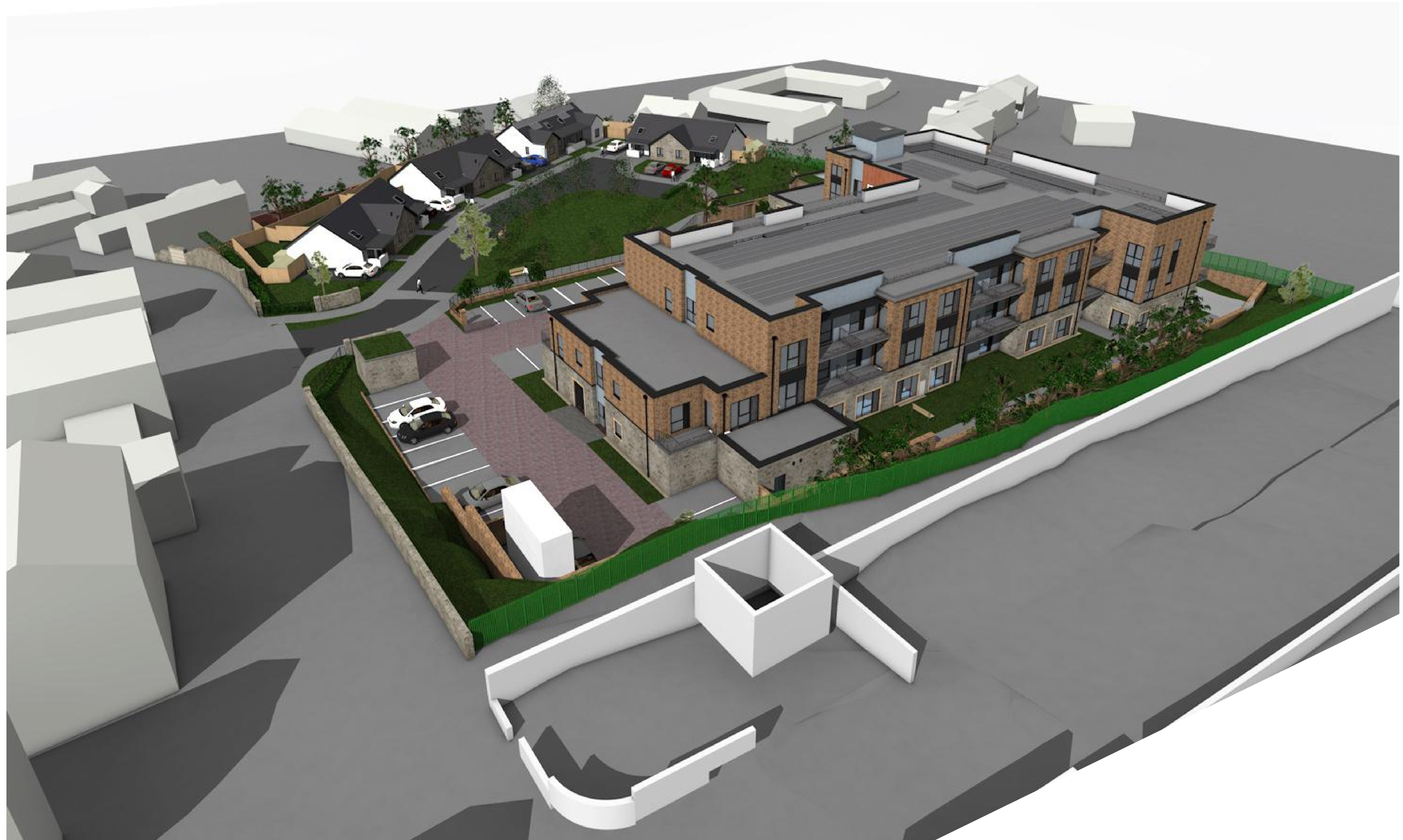
North Ariel View (NTS)