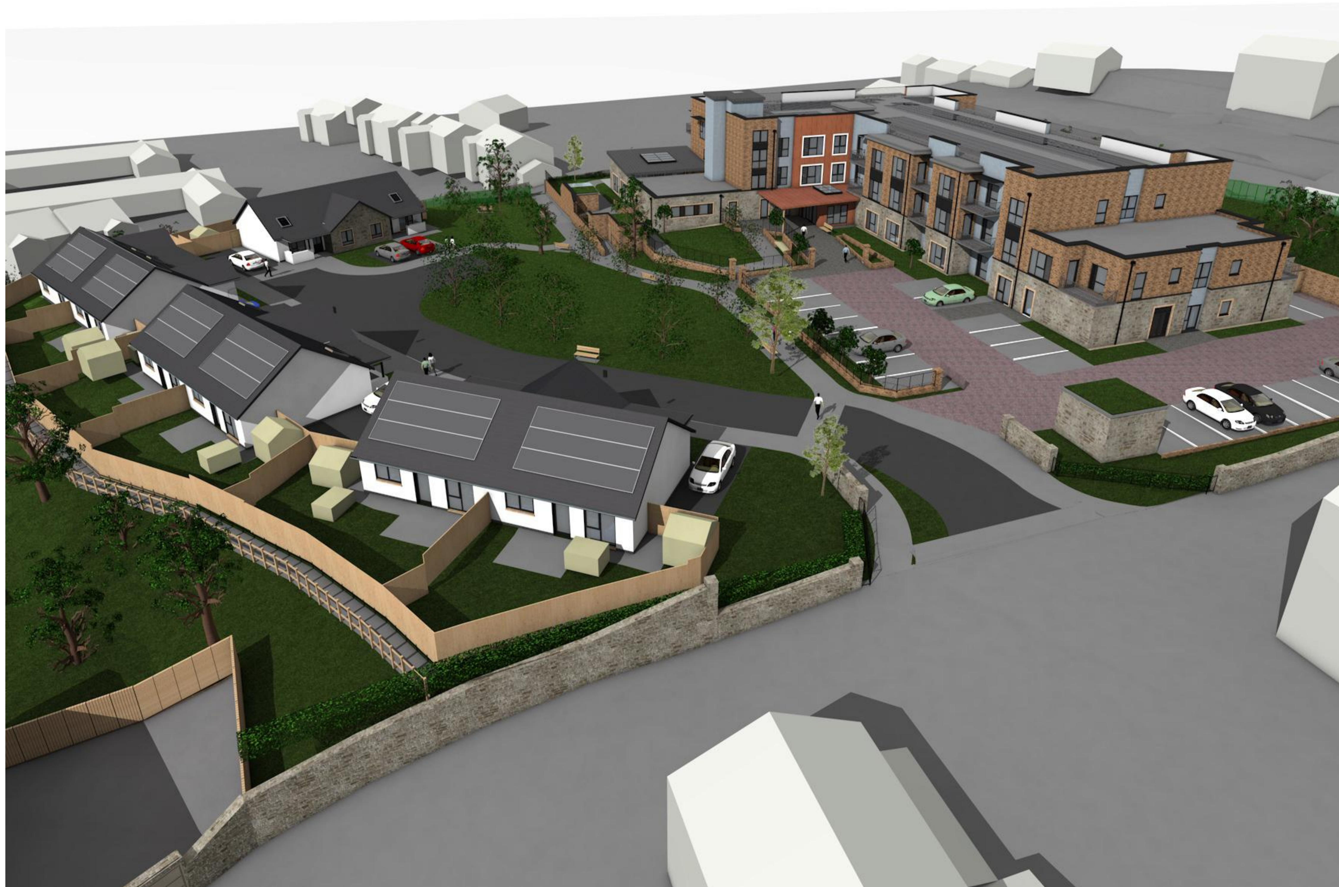
Site Entrance Ariel View (NTS)